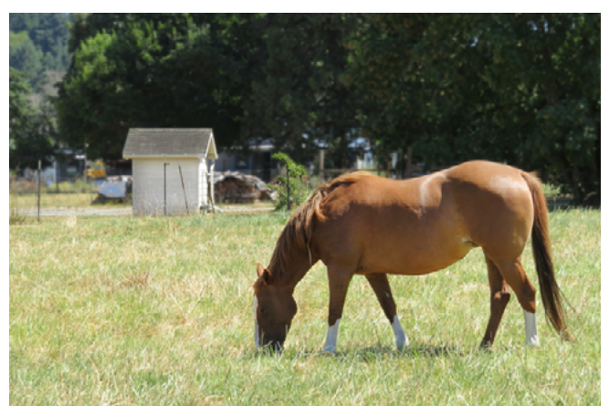
Figure 17. Keep horses and other animals fenced away from your wellhead.