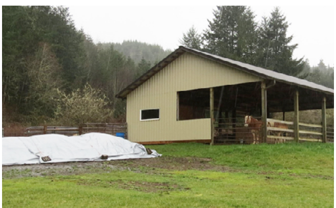
Figure 13. Covering stall waste with a tarp is a simple step that helps reduce runoff.