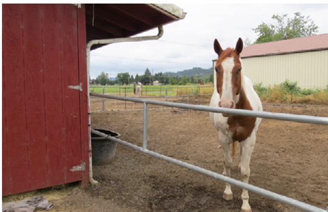
Figure 16. Gutters and downspouts reduce mud by directing water away from high-use areas.