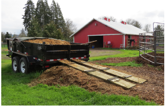
Figure 14. If you do not have enough land to apply manure safely, consider off-farm options that would use this resource.

Don't spread manure in the late fall when dormant plants are unable to take up nutrients. This practice often leads to surface and groundwater contamination.