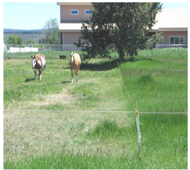
Figure 11. Divide pastures into paddocks with fencing. Rotate horses among the paddocks to give pasture plants time to regrow before re-grazing.

Single, large pastures are difficult to manage for correct grass height and are prone to overgrazing. Subdividing your pasture into several smaller pastures makes grass management easier. When the first pasture