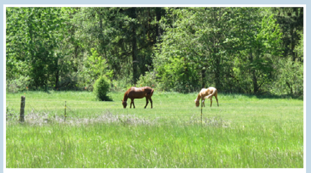
2 Manage pastures for optimal grass growth (page 6)