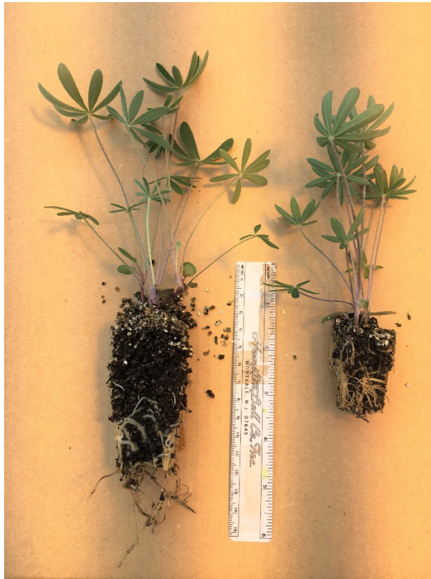
Figure 2. Kincaid's lupine ( Lupinus oregonus ) transplants grown in Hiko containers (left) and RootMaker containers (right). March 7, 2018.

southeast facing slope at 340 ft elevation. Soils are a Chehulpum complex, characterized by being shallow, well drained, and having a bedrock layer about 10-20 inches below the surface. Slopes vary from 12-40%.