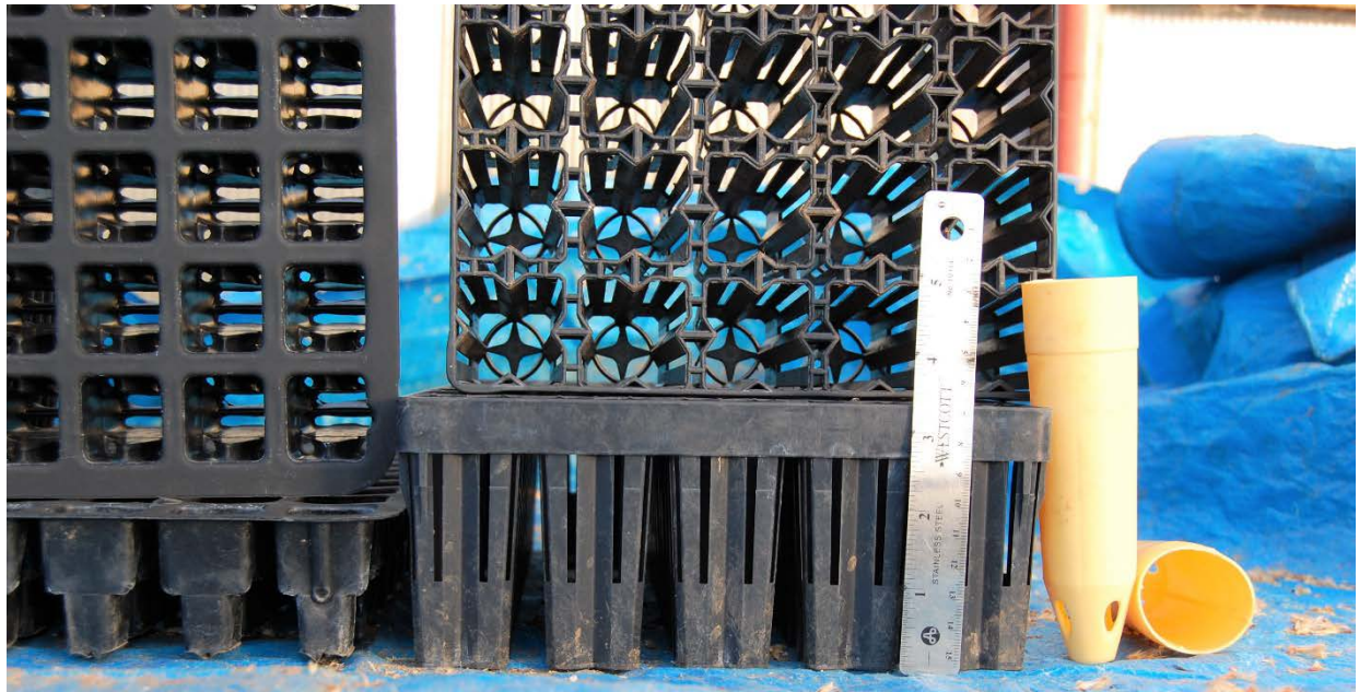
Figure 1. Comparison of containers used in this study. RootMakers (left) Hiko (center) and the standard Stubby container (right).

from the Baskett Slough National Wildlife Refuge population. Seeds were scarified prior to sowing using a lab-sized brush machine fitted with a sandpaper lined “scarifier drum”.