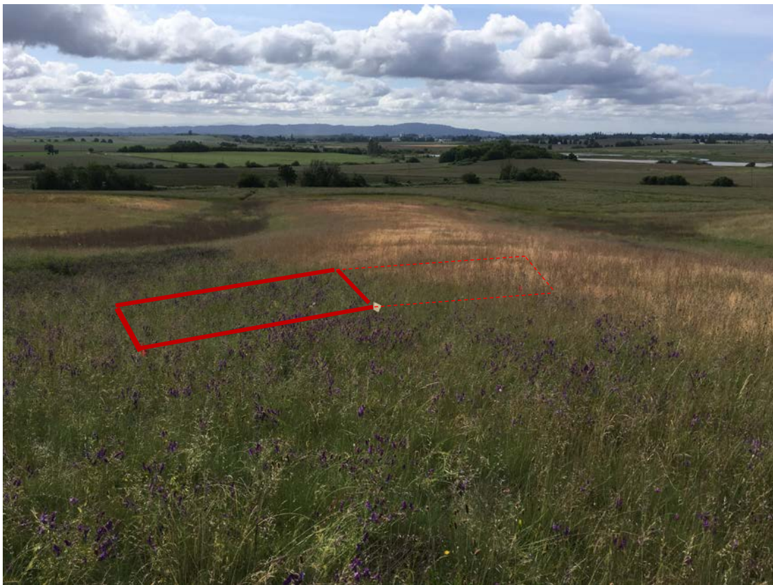
Figure 4. Site 2 at Baskett Slough NWR on May 28, 2018. Dashed red line shows original placement of plot, and solid red line shows where the site was moved to.

When PMC staff visited the site on May 28, 2018, vegetation surrounding Site 1 was turning brown and senescing. The brown vegetation lines followed the slope patterns. The higher parts of the ridges were turning brown first, while the lower spots remained green. The areas that were turning brown had more annual species than perennial species. It appeared that the brown areas were drying out faster; we assume that the soils are thinner here and there is bedrock about 6-10 inches below the surface. Site 1 fell directly in one of these brown patches. The site was specifically chosen by refuge staff due to the “lack of competing vegetation”. As predicted, the glyphosate spray did not kill the Roemer’s fescue within the plot, but did stunt it. The sprayed Roemer’s fescue plants in the plot looked healthy but were not flowering like the surrounding plants that had not been sprayed in February. The lupines in this plot looked very stressed, and most had died. It’s possible that the plants were entering their summer dormancy, but we believe that they were dead. Surveys in spring of 2019 will help us understand if the plants survived the summer drought, but it seems unlikely for many of them in Site 1. Site 2 looked much better, mainly because it had been moved from the top of the ridge (Figure 3). Existing vegetation was still green, and the lupines had grown since they were transplanted. Many had large, new leaves.