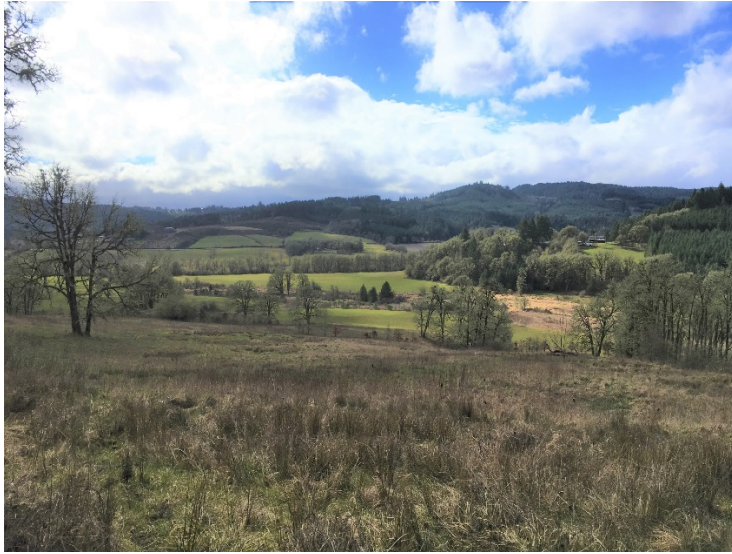
Figure 5. Mt Richmond, Yamhill County site chosen for Kincaid's lupine ( Lupinus oreganus ) out-planting trial. March 8, 2018.

In late June, both Sites 3 and 4 at Mt Richmond looked similar to each other in terms of dryness and competing vegetation. Gopher activity was high at Mt Richmond and was certainly a factor for individual lupine survival. However, the gopher activity appeared to be randomly distributed across treatments, so it was unlikely to affect our results.