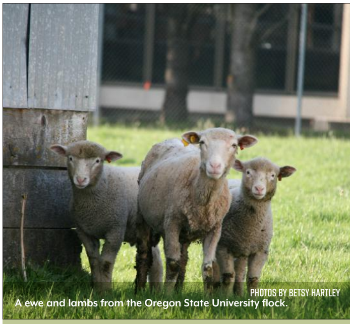
A ewe and lambs from the Oregon State University flock.