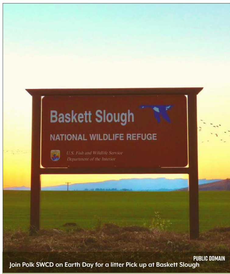
Join Polk SWCD on Earth Day for a litter Pick up at Baskett Slough

If you're like me and don't have several acres of land, don't fret! There's still so much that you can do to support conservation in Polk County. The City of Dallas will be hosting an Ivy Removal Work Day along the Rickreall Creek Trail on April 29. The Friends of Trees has a planting event at Eola Park in West Salem on Saturday, March 25. Polk SWCD is partnering with Andante Vineyard to do an Earth Day litter pick up at Baskett Slough. All these events are open to the public and still need volunteers. Most importantly, please take time for nature and enjoy the beautiful landscape in Polk County!