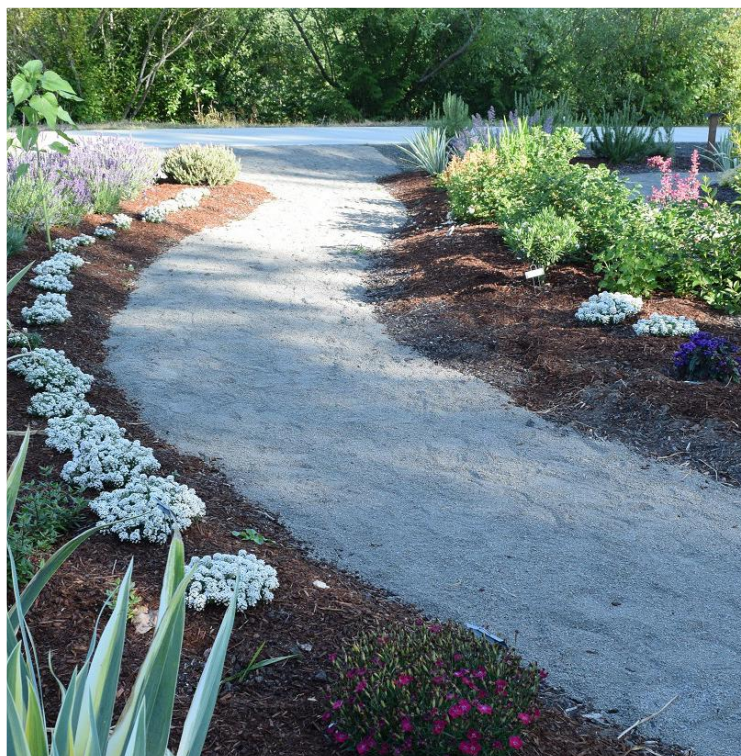
OSU Extension Polk County Master Gardeners have transformed and maintain a seven-acre parcel of land in Independence's Mt. Fir Park. The Inspiration Garden at Mt. Fir Park is a demonstration garden that promotes sustainable gardening practices and provides educational outreach to Polk County residents and home gardeners.