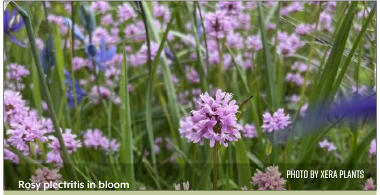
Rosy plectritis in bloom