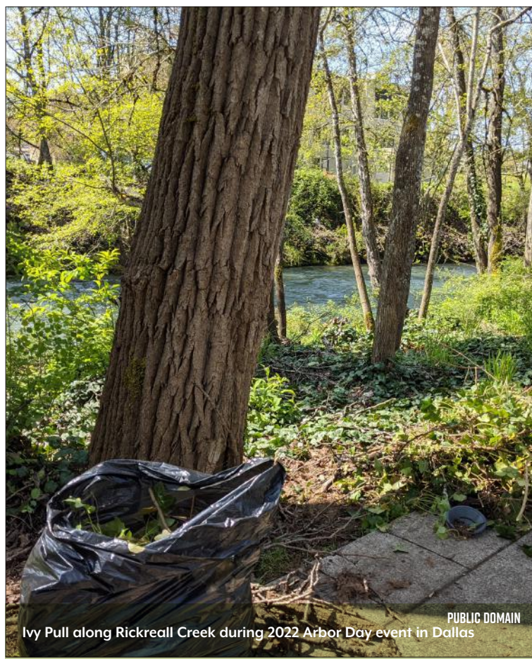
Ivy Pull along Rickreall Creek during 2022 Arbor Day event in Dallas

The Xerces Society is offering free habitat kits that contain native milkweed and pollinator-friendly wildflowers and shrubs at no cost to Oregon farmers and community partners. This unique program offers carefully selected, climate-smart, native and regionally appropriate plant materials directly to project partners who are willing to provide the time, labor, and land to develop these habitats. Go to Xerces.org and apply by April 3.