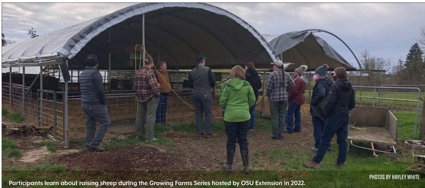
Participants learn about raising sheep during the Growing Farms Series hosted by OSU Extension in 2022.