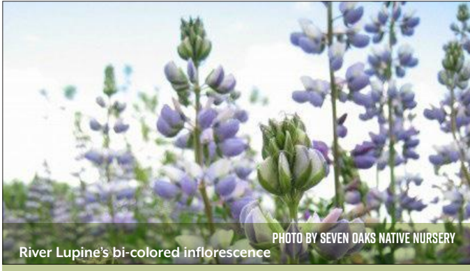
River lupine's bi-colored inflorescence